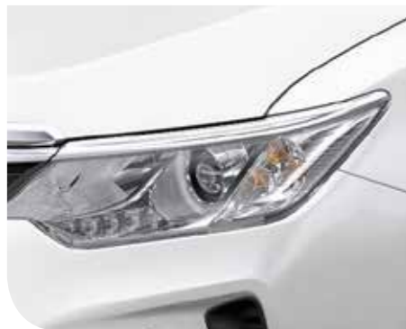
White Pearl CS (070)*