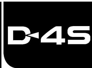
D-4S Fuel Injection System