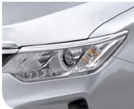
Silver Metallic (1D4)