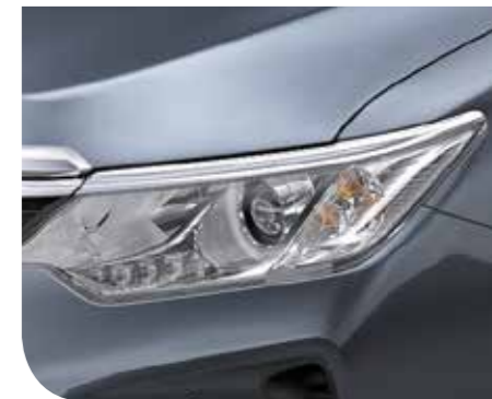
Greyish Blue Mica Metallic (8V5)