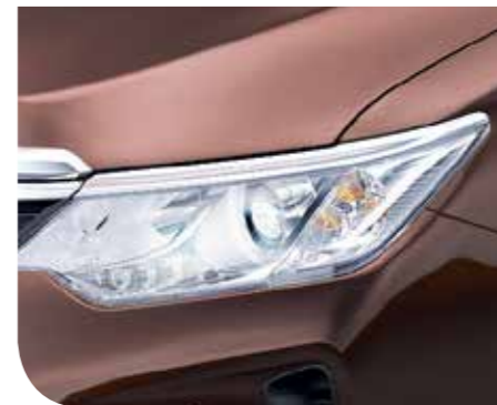
Phantom Brown Metallic (4W9)