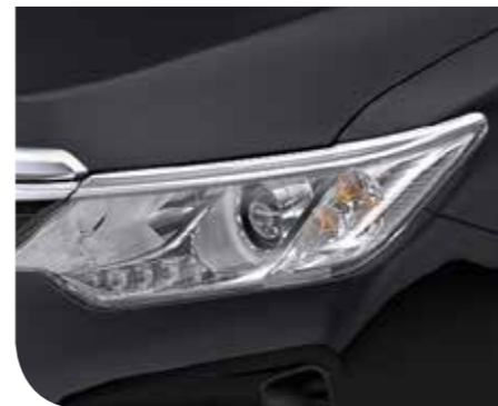
Attitude Black Mica (218)