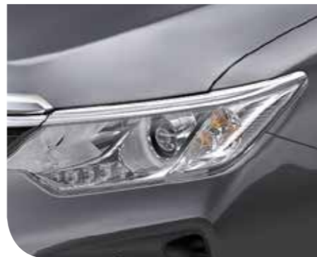
Grey Metallic (1G3)