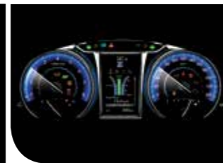
6-speed Super ECT