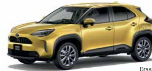
Brass Gold Metallic (5C2)