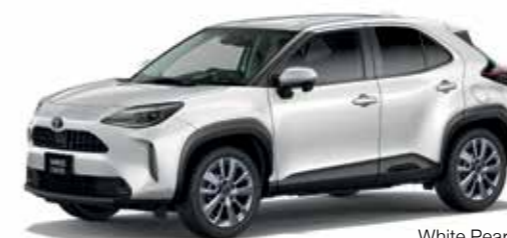
White Pearl Crystal Shine (070)