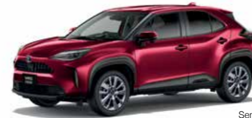
Sensual Red Mica (3T3)