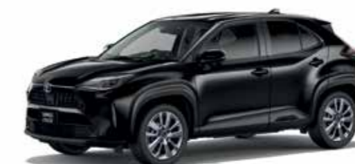
Black Mica (209)

Limitations of the PCS The driver is solely responsible for safe driving. Always drive safely, taking care to observe your surroundings. Do not use the pre-collision system instead of normal braking operations under any circumstances. This system will not prevent collisions or lessen collision damage or injury in every situation. Do not overly rely on this system. Failure to do so may lead to an accident, resulting in death or serious injury. Although this system is designed to help avoid a collision or help reduce the impact of the collision, its effectiveness may change according to various conditions, therefore the system may not always be able to achieve the same level of performance. Do not overly rely on this system and always drive carefully.