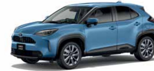
Grayish Blue (8W2)