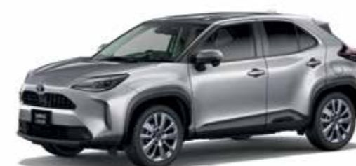
Silver Metallic (1L0)