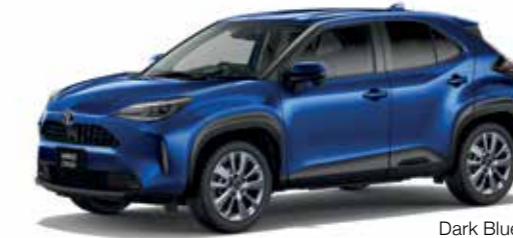
Dark Blue Mica Metallic (8W7)