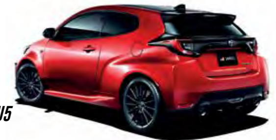
EMOTIONAL RED 2 / 3U5