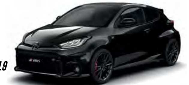
PRECIOUS BLACK / 219