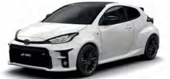
SUPER WHITE / 040