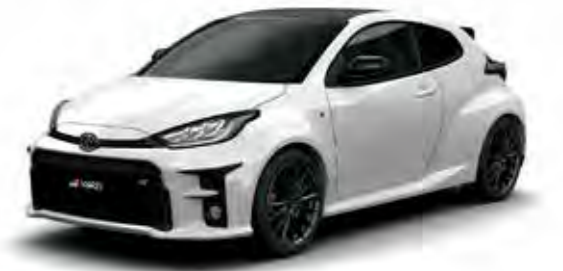
PLATINUM WHITE PEARL MC / 089