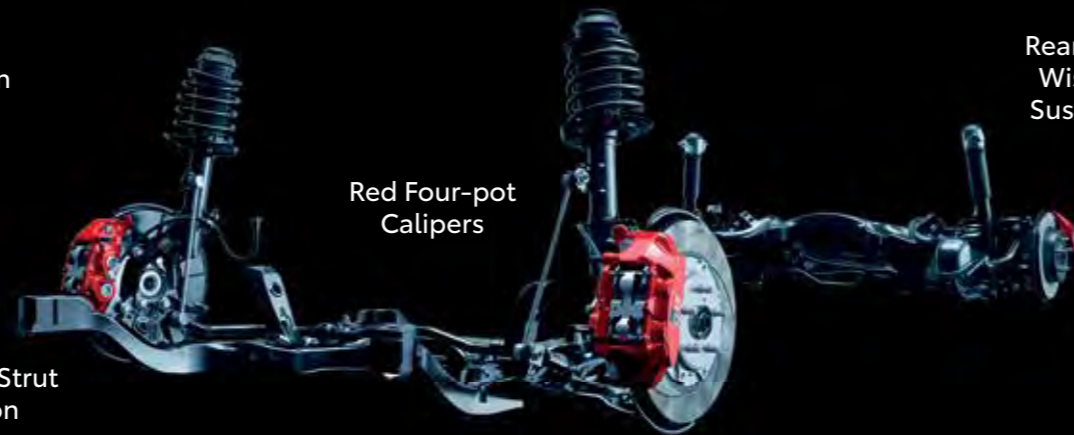
Red Four-pot Calipers