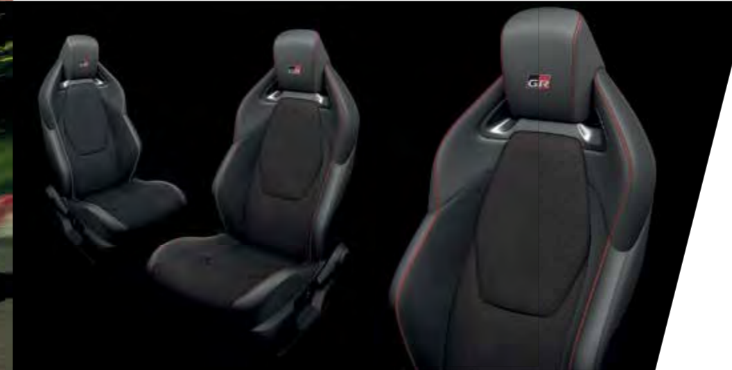
ULTRASUEDE + LEATHER WITH CONTRASTING RED STITCHING