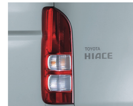
Silver Mica Metallic (1E7)